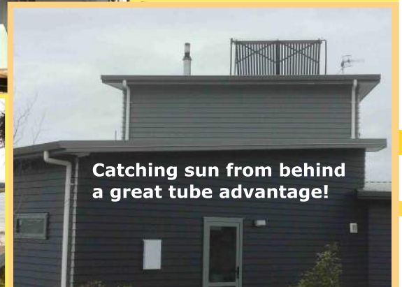
Catching sun from behind a great tube advantage!