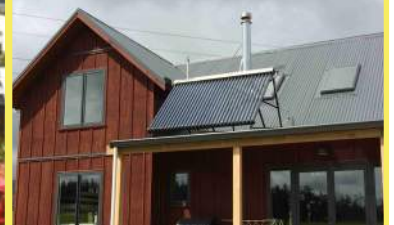
A recently installed 30 tube collector to an off grid home