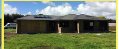
A 20 tube thermal and 1 kw PV perfect for this group home builder