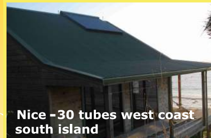
Nice -30 tubes west coast south island