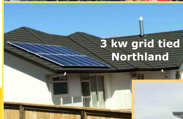
3 kw grid tied Northland