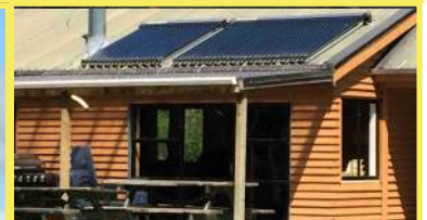
The peel forest outdoor pursuits centre SolarPeak collectors to heat water