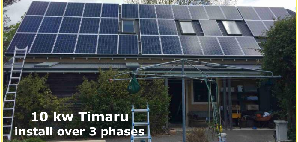
10 kw Timaru install over 3 phases